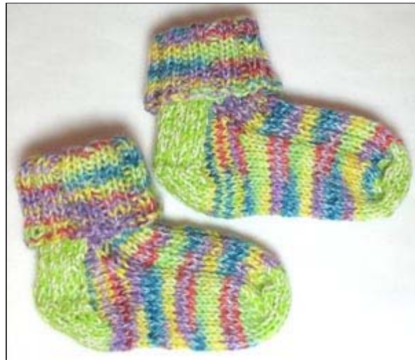
RO's FIRST SOCKS!

Visit our Online Photo Gallery for lots of new needlepoint and knitting projects created by our talented customers and associates.