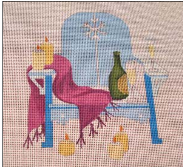
Come see these delightful canvases depicting chairs themed for each month of the year. (Shown above: January)

Canvases – new canvases are arriving almost daily!